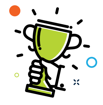
Excellence , always

CBLA values describe how we work. CBLA's core values: