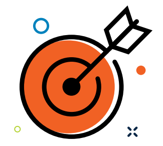
One team, one mission